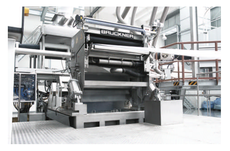
Fig. 3. Brückner film casting unit

Certain technical requirements must be fulfilled for the production of 5- or 7-layer film. The investment for the line modification is about 10 % of the initial investment cost depending on the configuration of the existing BOPP line. The financial risk is therefore low. The up-