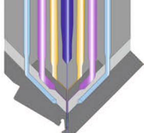
Fig. 1. Comparison of various dies (3-, 5- and 7-layer film)